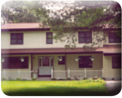
HARVEST GROVE, Lake Grove, NY