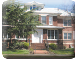
HARVEST PARK, Floral Park, NY