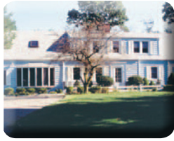
HARVEST HOUSE, Syosset, NY